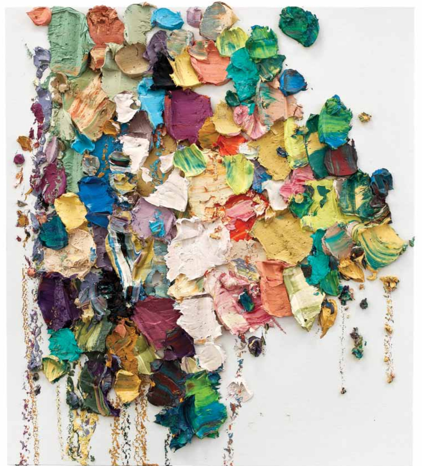
Transcribing the Buddhist Diamond Sutra I, 2013, oil on canvas, 180 x 160 cm, courtesy of the artist and Pearl Lam Gallery