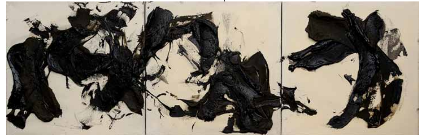
Jinshi 4 (triptych), 1990, oil on canvas, 65 x 195 cm, courtesy of the artist and Pearl Lam Gallery

Zhu Jinshi's work encompasses and transcends cultural references, and shies away from theoretical definition. While theoretical and conceptual analysis are valid forms of comprehension, ultimately it is in the visual world in which art is rooted, and Zhu's paintings calculate a sensory balance so often forgotten in the realm of contemporary art.