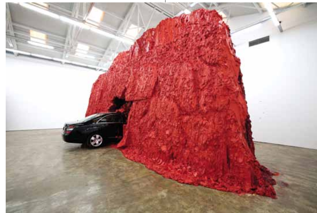
Power and Jiangshan, 2008, ten tons of paint and one Mercedes car, courtesy of the artist and Pearl Lam Gallery

'The theories about two-dimensional and three-dimensional paintings arise from discourses on the thickness of paint. We can more or less be satisfied that Realist painting represents reality in three-dimensional form, while two-dimensional abstract art is regarded the quintessential or